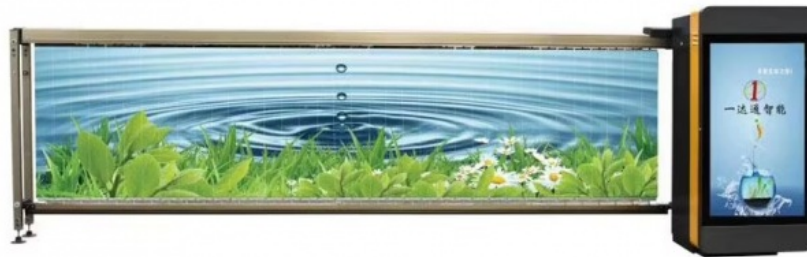
1. Advertidsing Gate