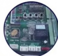
Brush-less DC Control board