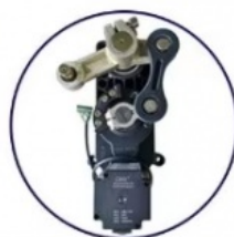
Brush-less DC24V motor