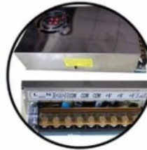
24V10A Power supply