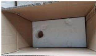
1.Put polyurethane foam inside