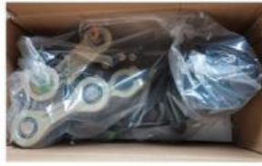
2.Cover with plastic and put the motor into the carton