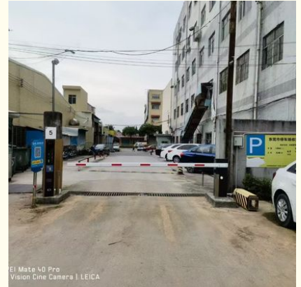
El Mate v0 Pro Vision Cine Camera | LEICA