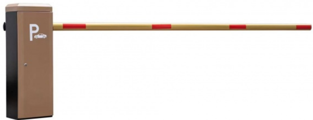
1. Straight rod