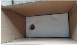
1.Put polyurethane foam inside