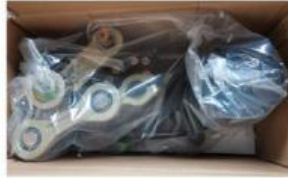
2.Cover with plastic and put the motor into the carton