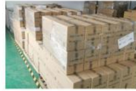
3.Seal the carton with tape