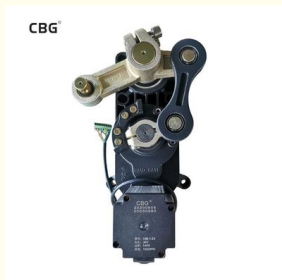
Three fastest speeds to choose