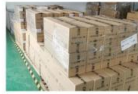
3.Seal the carton with tape