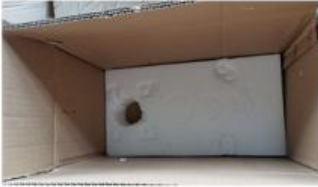
1.Put polyurethane foam inside