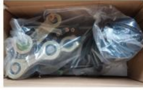
2.Cover with plastic and put the motor into the carton