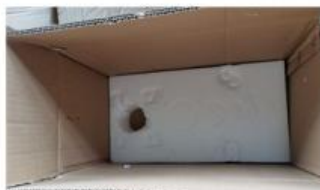
1.Put polyurethane foam inside