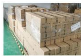
3.Seal the carton with tape