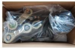
2.Cover with plastic and put the motor into the carton