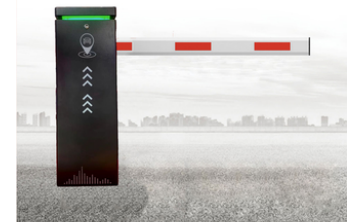
DC BRUSHLESS BARRIER GATE