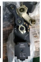
Fastest speed: 2.55