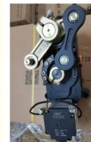
Fastest speed: 0.65